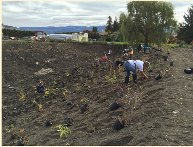
Volunteers at work planting the restored wetland at Black Road in Vernon

A project that has been nearly three years in the planning has entered a new phase. Okanagan Similkameen Stewardship (OSSS) Wildlife Habitat Stewards Wayne and Wendie Radies wanted to construct a wetland on their Vernon property. From September 28 to October 2, a compacted clay liner was established using clay from the site. After the rainfall on Friday, the wetland was already holding water! 700 potted plants in addition to salvaged sedges were planted on Saturday afternoon.