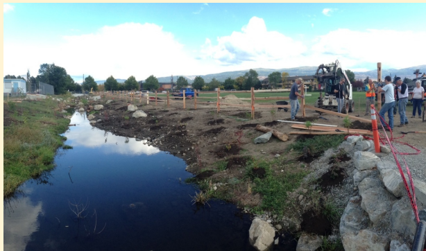
Thanks to students at KLO Middle School and many project partners, 200 m of Fascieux Creek is now daylighted!

The first phase consisting of 70 m, was started during late 2014 and finished during spring 2015. It included a turtle pond and pedestrian crossing. Phase 2 started during summer 2015 and is just finishing up. It included a second pedestrian crossing, a sediment detention pond for the City of Kelowna to maintain,