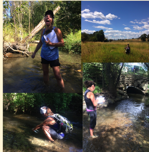
Volunteers assessing water along Coldstream Creek

Society for the Protection of Kalamalka Lake Volunteers from the Society for the Protection of Kalamalka Lake (SPrKL) assisted Western Water Associates Ltd., with sampling near surface groundwater and surface water along Coldstream Creek on August 18th and August 19th. The volunteers carried equipment, took pictures, recorded field measurements and sketched each site. Work was arduous and hot but the volunteers worked hard. Their assistance was invaluable. A memo including the results of the assessment will be available on SPrKL's website in October of 2015.