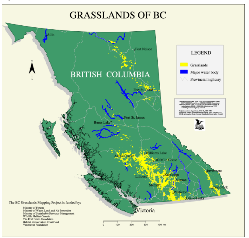
Figure 1: Distribution of Grasslands in British Columbia

Grasslands not only provide habitat for a wide variety of species, but they also provide a significant forage base for BC's ranching industry. Domestic livestock grazes about 90 per cent of BC's grasslands, either through private rangelands, grazing tenures on provincial crown land or grazing regimes on First Nations land.