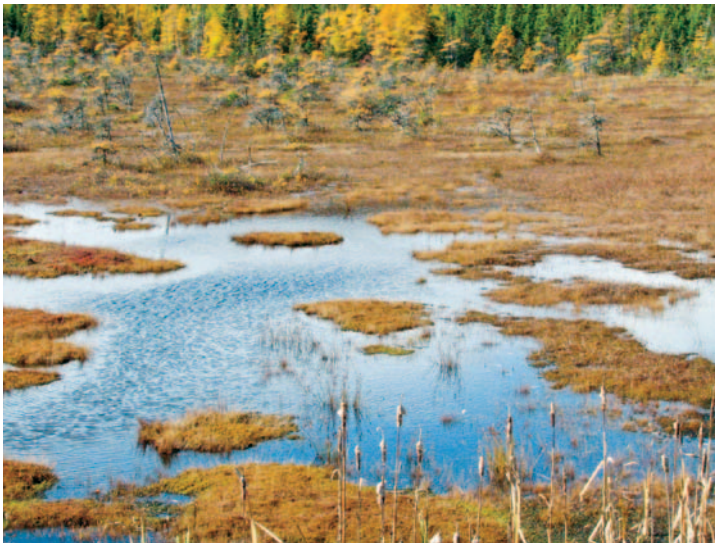
Cape Breton Bog