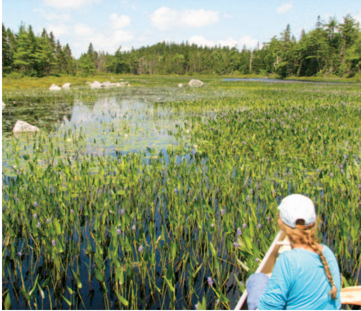
Tangier Grand Lake Marsh

Each type of wetland has a unique set of ecological conditions. However, wetlands can be characterized generally as habitats that have water at or near the surface (<2 m deep), little or no current (water flow), plants and animals that thrive in wet conditions and peat or rich mineral soils that develop where water saturates or floods the surface at least seasonally.