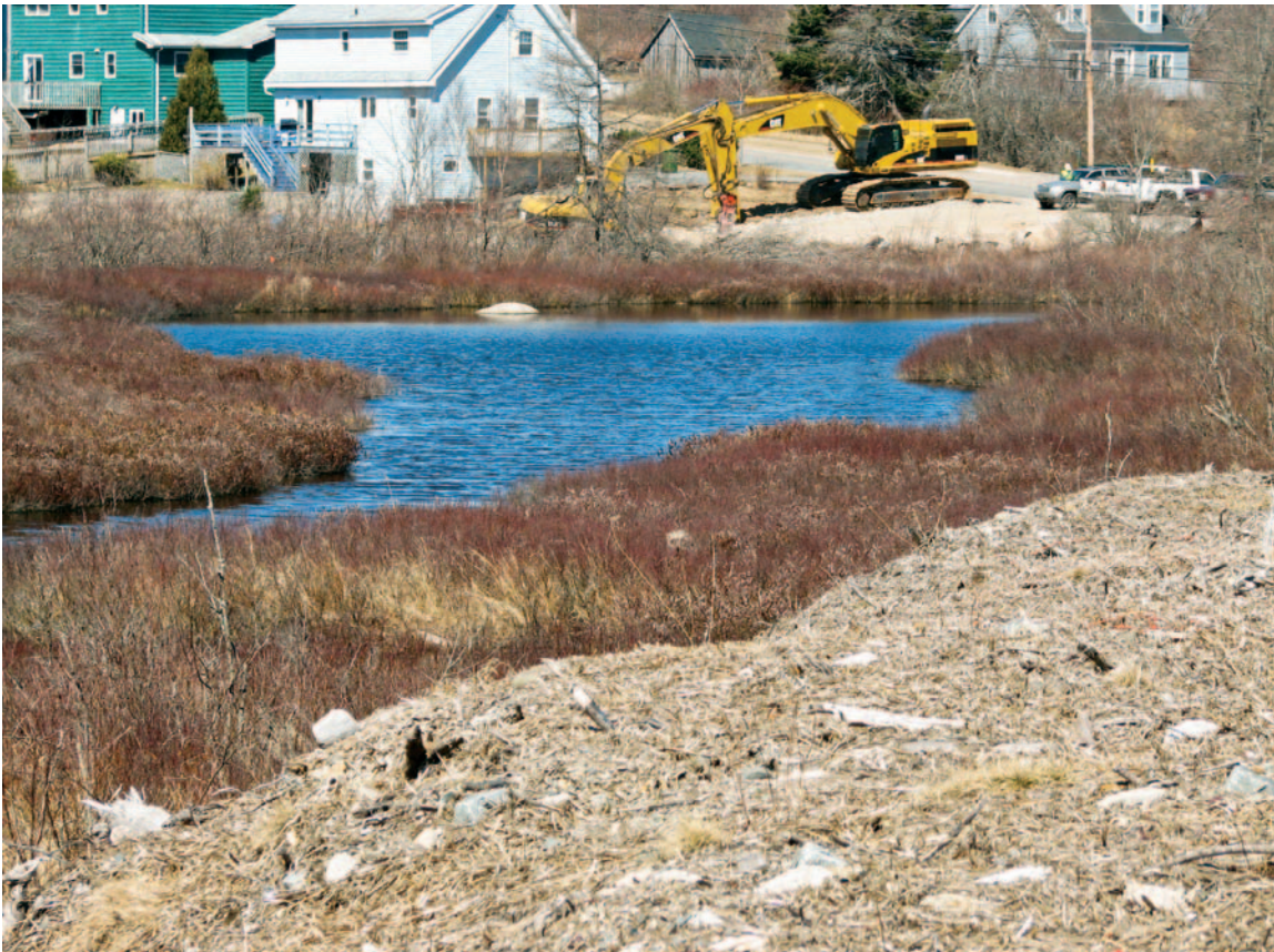
Kidston Pond near Spryfield