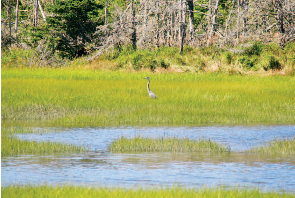
Great blue heron fishing in a salt marsh at Martinique Beach