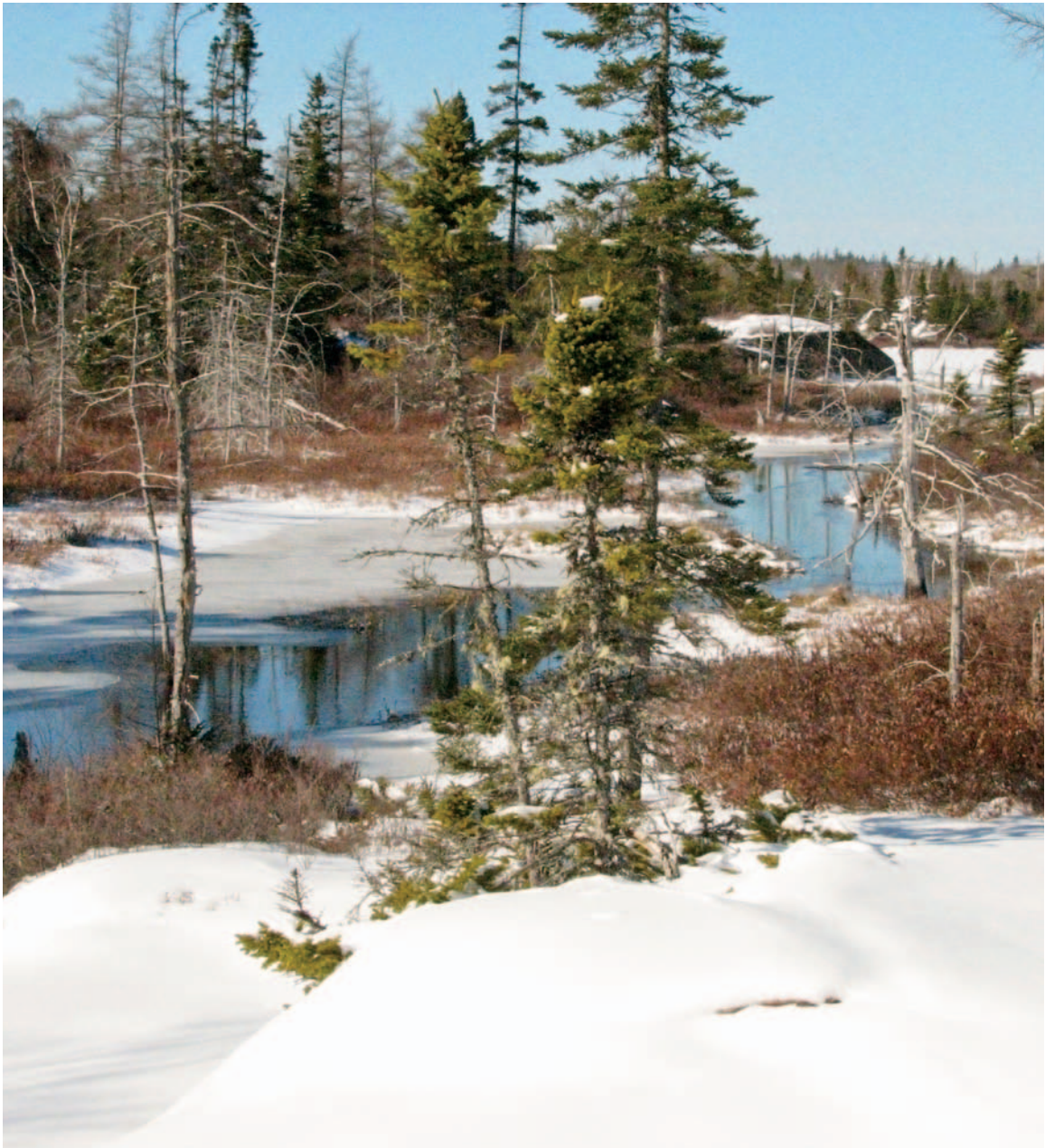
Riparian fen-swamp complex in the Blue Mountain–Birch Cove Lakes Wilderness