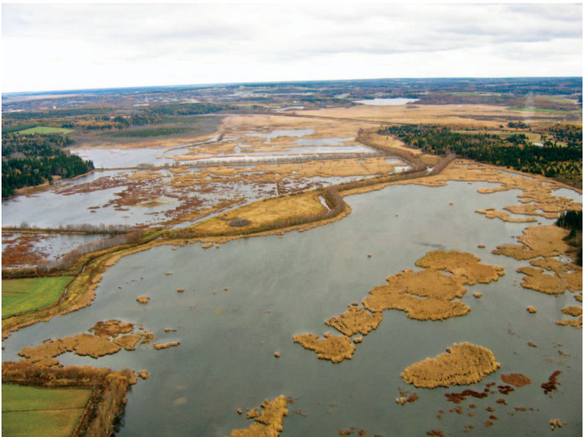
Chignecto National Wildlife Area near Amherst Point