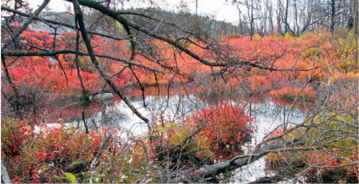
Late fall vernal pool near Herring Cove

Natural events, such as storms, that affect the flow of water can lead to wetland formation over the course of several years. It is the responsibility of all landowners to be aware of this potential and manage their land appropriately based on their intended future use. For example, if property owners identify a drainage problem caused by a storm on land that they intend to develop, they may wish to address standing water to avoid conditions that might create a wetland over time.