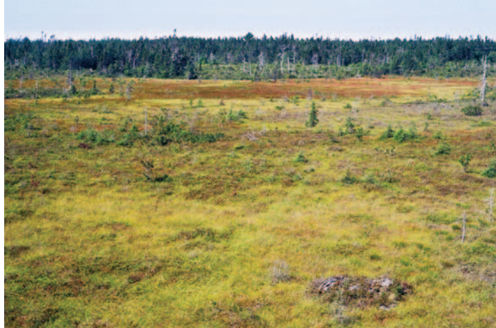
Shelburne area bog

As natural processes raise the bog surface, the water table in the bog rises relative to the elevation of the water table at the edges of the bog. Precipitation, fog and snowmelt are the primary water sources. Bog waters are low in dissolved minerals and acidic (usually between pH 4.0 and 4.8).