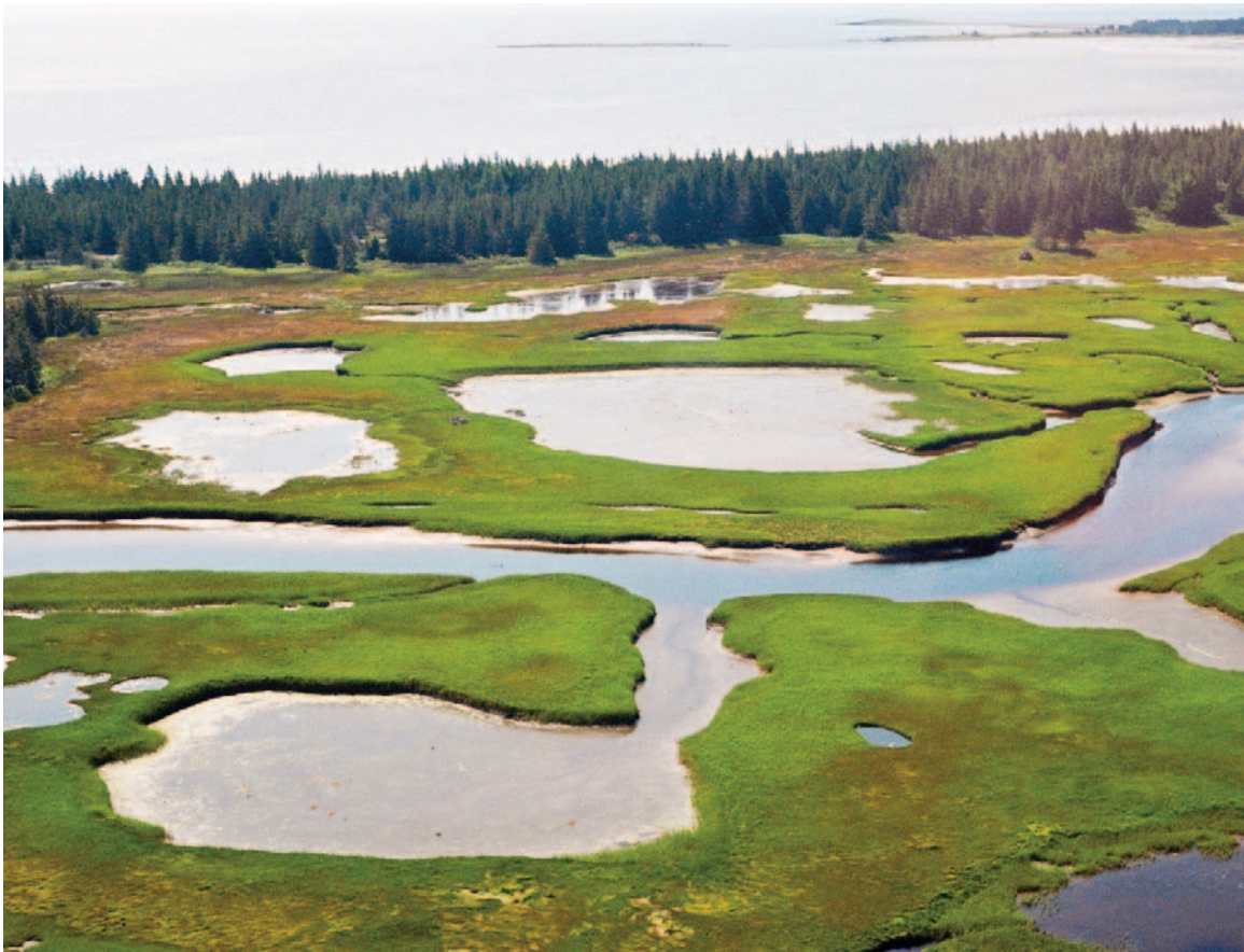
Salt marsh complex in Shelburne County