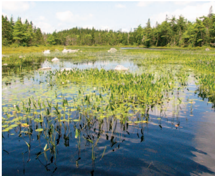
Emergent lacustrine marsh

a shallow-water wetland with water levels that fluctuate daily, seasonally or annually, occasionally drying up or exposing sediments. Marshes receive their water from the surrounding watershed as surface runoff, stream inflow, precipitation and groundwater discharge, as well as from longshore