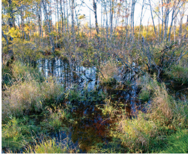
Pictou area vernal pool

these are small (typically less than 0.5 ha), shallow wetlands that lack permanent inlet or outlet streams and often dry out in the summer. They provide critical breeding habitat for frogs, salamanders, insects and fairy shrimp and feeding and drinking sites for birds, mammals, turtles and other wildlife.