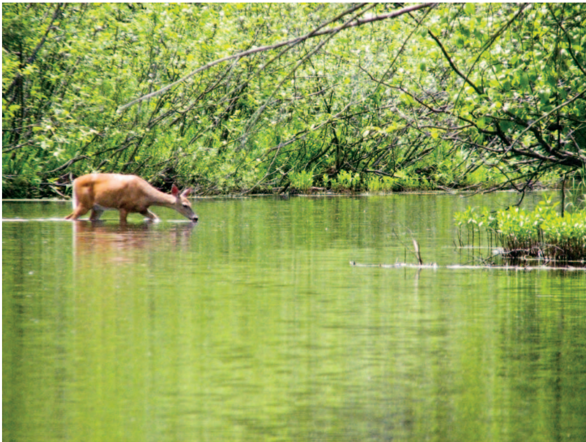
White-tailed deer drinking near a riparian shrub swamp

In the future, we plan to continually evaluate wetland conservation tools and practices from other provincial, federal and U.S. state jurisdictions and to adopt or adapt those deemed most efficient and effective for Nova Scotia. When feasible and effective for Nova Scotia, we will align wetland conservation tools and practices to increase consistency and clarity in wetland management throughout the Maritime provinces and across Canada.