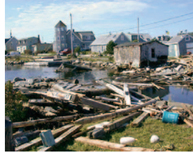
Hurricane Juan damage in Prospect, NS

levels in Atlantic Canada will rise at least 1 m over the next century. Higher water levels are expected to result in eroding shorelines, increased flooding during storms and high tides, damage to wharves, buildings and roads and contamination of drinking water supplies with salt water. Coastal development and rising seas have already degraded salt marshes and other coastal wetlands, leaving coastlines more vulnerable to large storms.